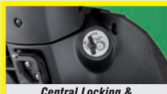
Central Locking & Unique Safety Shutter

Longer life, does not leak and damage the paint or body