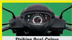
Striking Dual-Colour Meter Console

Clear layout with easy-to-read large icons