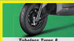
Tubeless Tyres & Telescopic Suspension

Superb stability with minimum air leakage during punctures