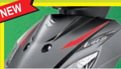
Dynamic Dual Tone Styling