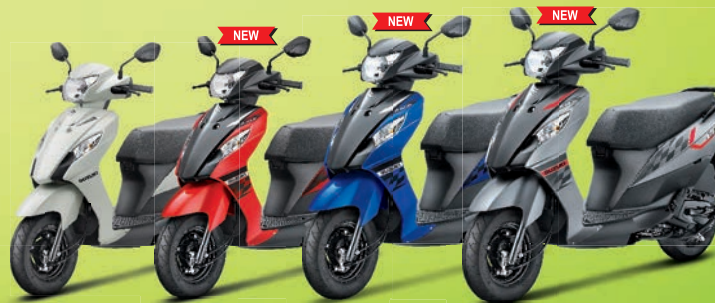
YPA: Pearl Mirage White ARB: Pearl Mira Red/Matte Black BAW: Pearl Suzuki Blue No2 /Matte Black AHW: Matte Grey/Matte Black