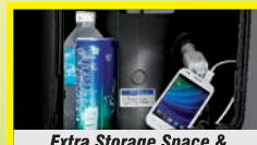
Extra Storage Space & Mobile Charger

Ignition, steering and seat lock operated through a central lock with safety device