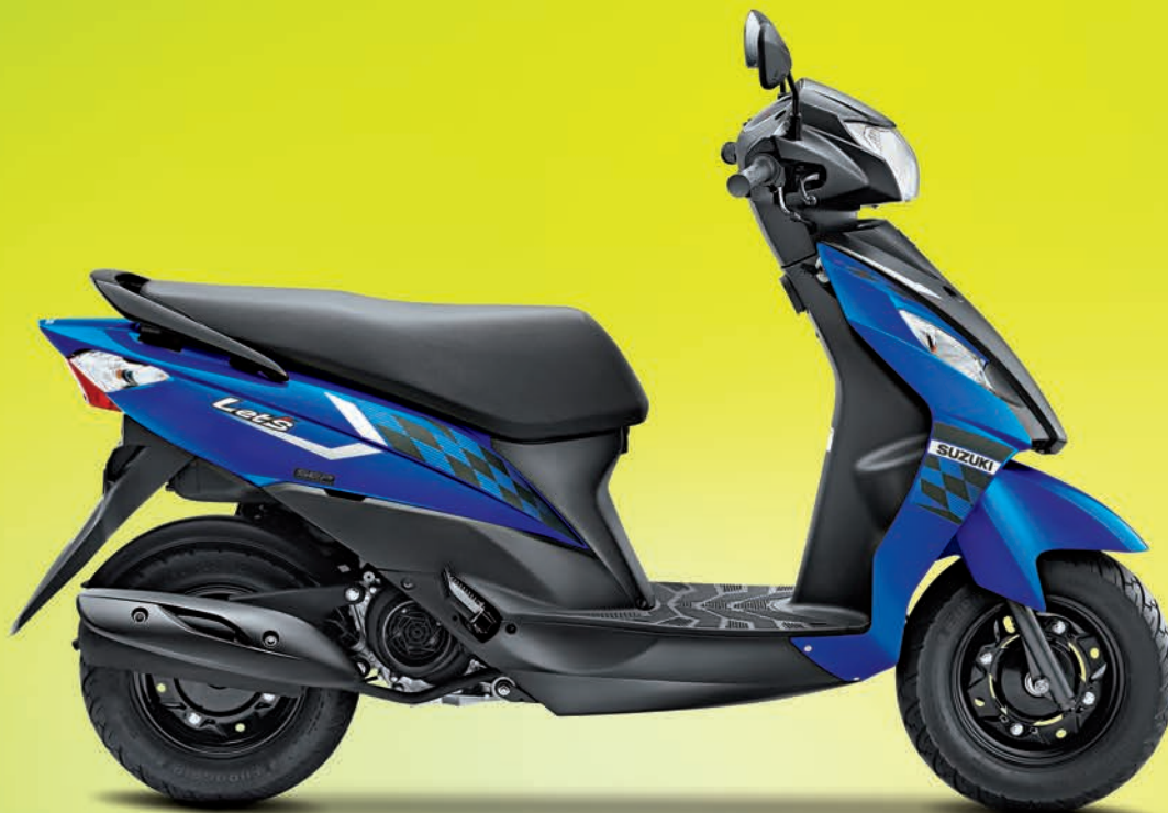
BAW: Pearl Suzuki Blue No2 /Matte Black