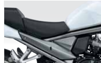
Height adjustable seat