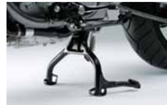
Convenient center stand