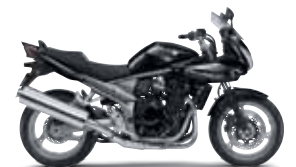
Glass Sparkle Black (YVB)