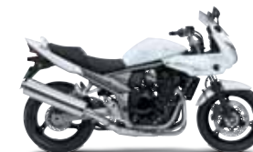
Glass Splash White (YBD)