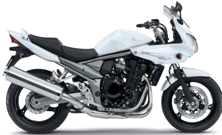
Glass Splash White (YBD)